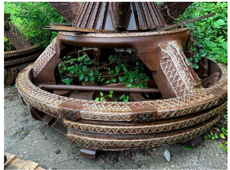
AVN 1500 TB MACHINE REAR SIDE